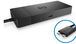
Dell Performance Dock – WD19DCS

Includes a 180W power adapter and delivers up to 130W of power to Dell PCs and up to 90W to non-Dell PCs 2 .