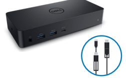
Dell Universal Dock – D6000

Includes a 240W power adapter and delivers up to 210W of compatible Dell PCs via dual connectors. Delivers 130W of power to Dell PCs and up to 90W to non-Dell PCs via a single connector.