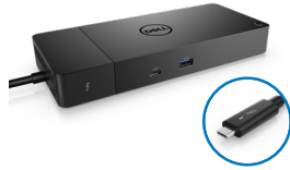
Dell Thunderbolt Dock – WD19TBS

Includes a 180W power adapter and delivers up to 130W of power to Dell PCs and up to 90W to non-Dell PCs 2 .